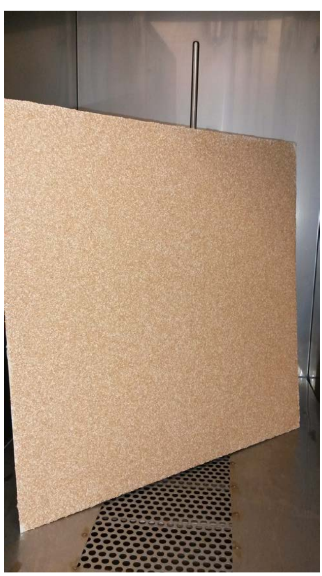
Peran STB Public